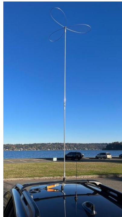
Aluminum mast (2.25 m) with cap hat, resonant on 15 m (no loading coil).

My mobile configuration was based on my setup in 2022, but with some antenna upgrades (FT-891/FC-50, 100 W; aluminum mast sections and cap hat for 15 m, loading coils for 80/40/20 m; quarter wave steel whip for 10 m). The newly built 80-m coil needs more work to make antenna tuning practical, given its very narrow bandwidth. Over a year ago I already had converted logging from Fldigi on a MacBook to N1MM+ on an Acer Windows 11 laptop.