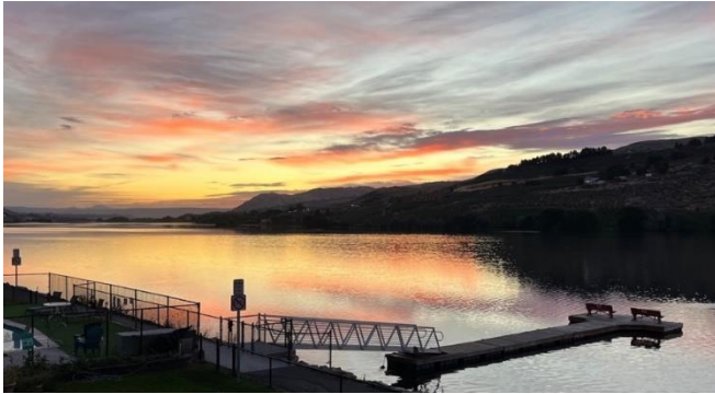
Early morning scene at the Columbia River in Pateros, Okanogan County.

My last operating location (7) was at the Lincoln-Grant-Adams Tri-county intersection, running with LIN/GRAN/ADA exchanges.