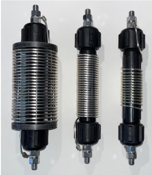
Loading coils for 40, 30 and 20 m, made from Banjo polypropylene fittings and silver coated copper wire.