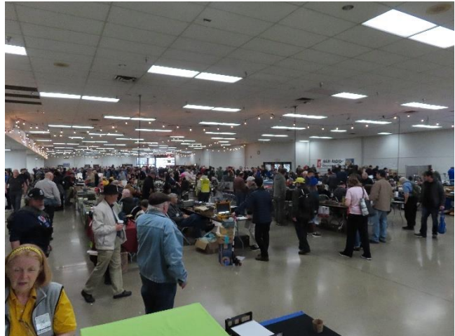
View from the PA booth