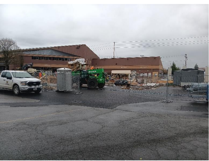
The year of construction